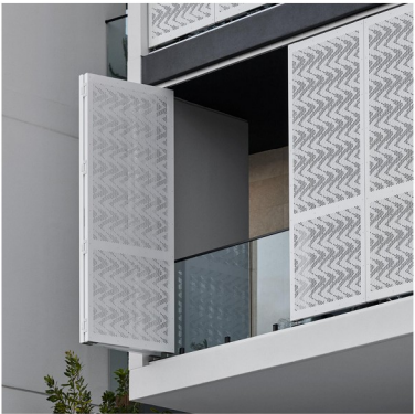
Bifold privacy screening