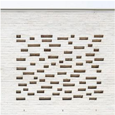
Hit & miss brick screening

1. Refer to Cover Sheet 00 for current building facade. Photomontage from original Oct 2021 submission has been provided for reference only. Refer to elevations for exact locations of finishes