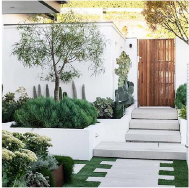
Feature Planter Boxes