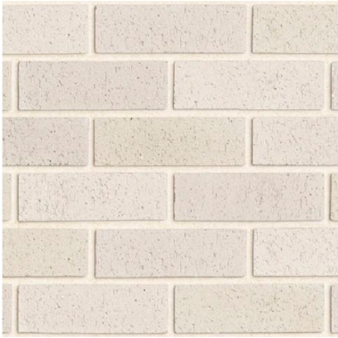
Light Face Brickwork - Austral "Honed Concrete" or similar - Msn02