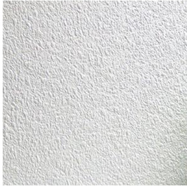
White Rendered Slab Edges - Ren01