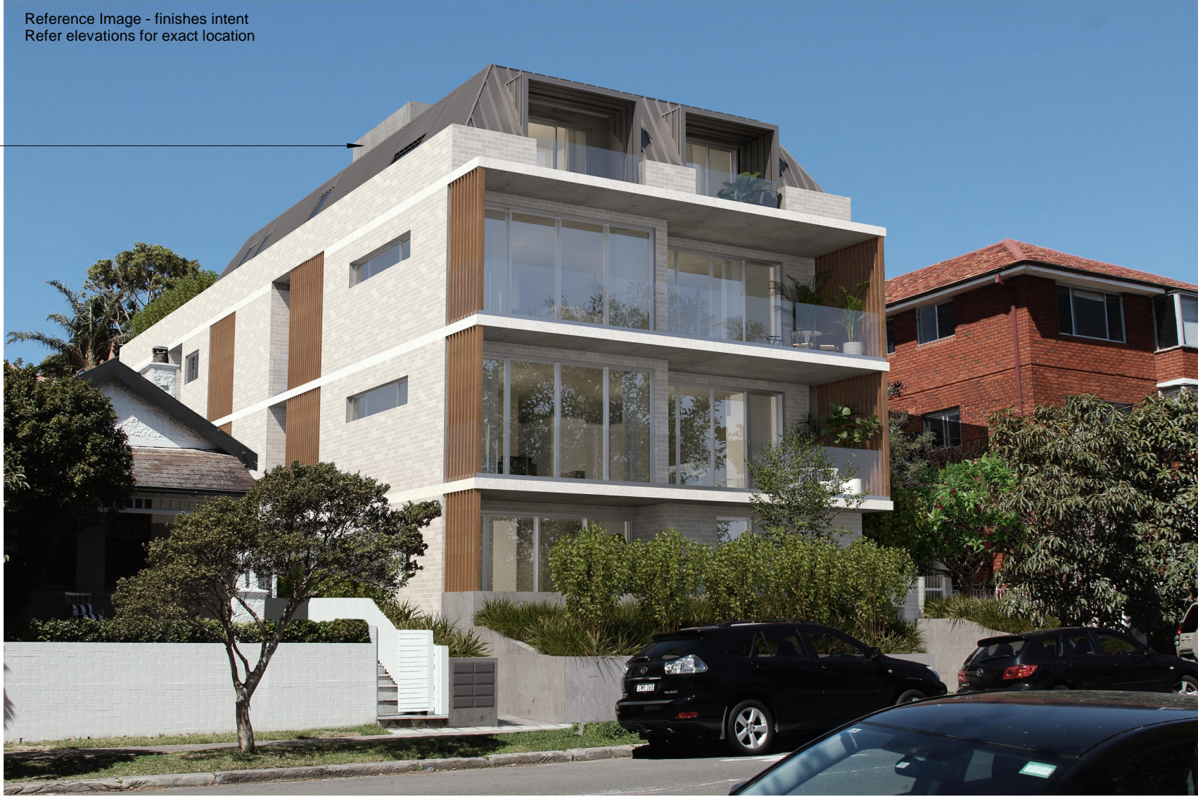
Reference Image - finishes intent Refer elevations for exact location