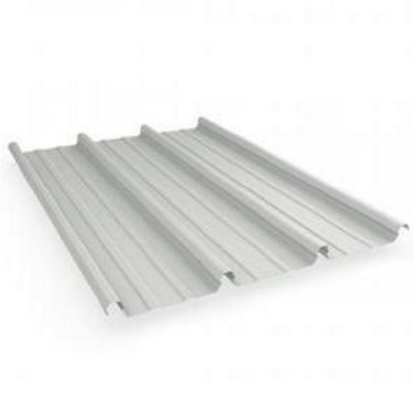
Metal Roofing Profile - Lysaught Klip Lok or similar