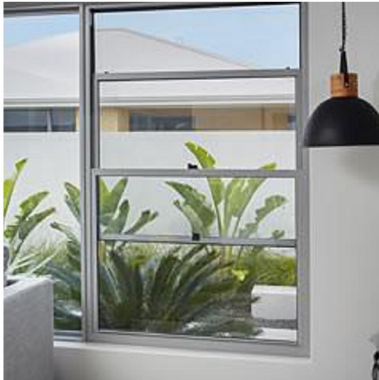
Aluminium Framed Doors & Windows - Grey/Light Finish