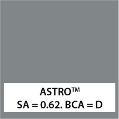
Sheet Metal Roofing - Colourbond 'Astro' - CB