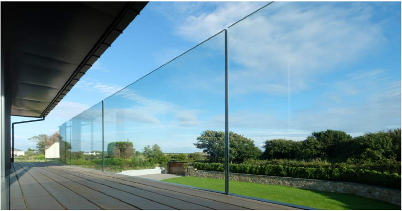
Frameless Galss Balustrade - GB01